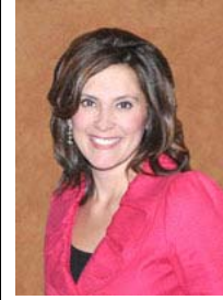
Minority Leader Gretchen Whitmer (D) District 23 – East Lansing