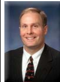
John Moolenaar (R) District 36 – Midland