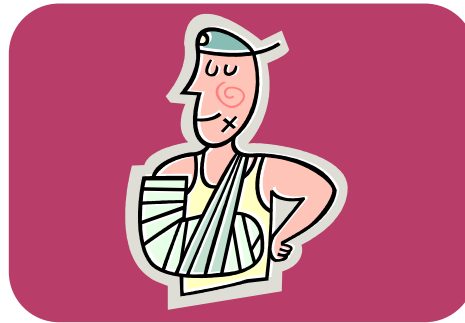
Permission to Treat