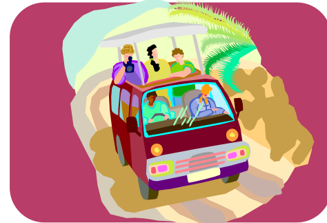
Permission to Transport