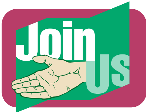
Permission to Join